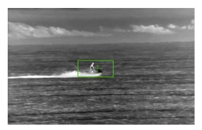
Tracking a jet-ski using IR video

The Vision4ce CHARM 3U video tracker uses the DART (Detection & Acquisition, with Robust Tracking) detection and target tracking software hosted on an embedded multicore ARM processor board for video tracking and image processing applications.