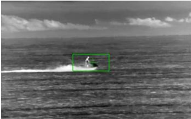
Tracking a jet-ski using IR video

If appropriate options are selected this board is a replacement for ADEPT 60 and ADEPT 36