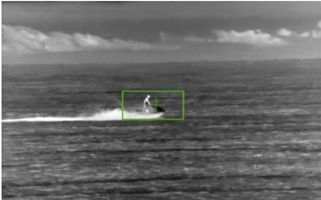
Tracking a jet-ski using IR video

The CHARM Module is used as the core processing module on the Vision4ce standard form factor video trackers such as 3U VME/cPCI, 6U VME, PC-104, etc. Multiple modules can be integrated onto larger boards allowing for comprehensive multi-channel tracking solutions. It can also be directly integrated onto a host board for size, weight and power (SWAP) optimized systems.