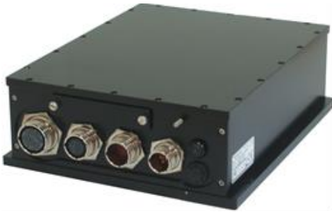
GRIP Epsilon with removable drive

General-purpose Rugged Integrated Processor Conduction cooled