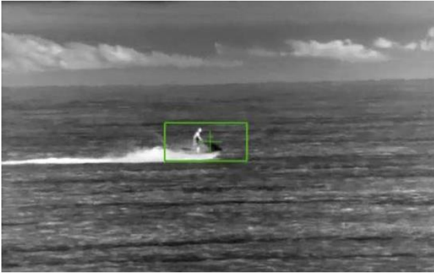
Tracking a jet-ski using IR video

The Vision4ce CHARM 3U cPCI video tracker uses the DART (Detection & Acquisition, with Robust Tracking) detection and target tracking software hosted on an embedded multicore ARM processor board for video tracking and image processing applications.