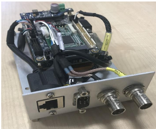
CHARM-10CE on mounting plate

The CHARM-10CE is available mounted on an enlarged cooling plate that also offers standard connectors for Ethernet, Serial and Video inputs.