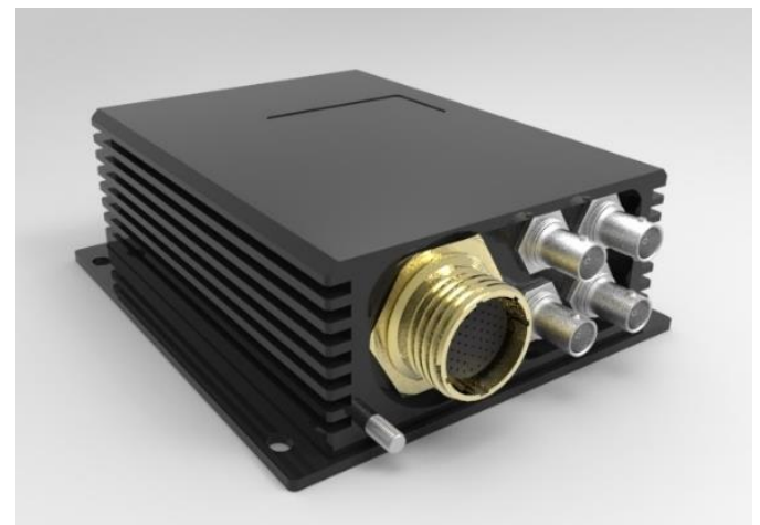
CHARM-10CE in rugged enclosure