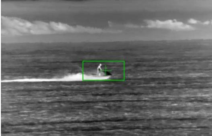
Tracking a jet-ski using IR video

The Vision4ce CHARM-10CE is a standalone video processing stack for embedded video and image processing applications which is designed to host the Vision4ce VMS software. The VMS software includes the field proven DART video tracking software. The CHARM-10CE is based on an Intel Atom embedded processor which incorporates a multicore x64 processor and powerful embedded GPU. Video interfaces are provided for HD and SD video in both analog and digital formats.