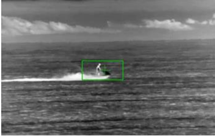
Tracking a jet-ski using IR video

The Vision4ce CHARM-70 product uses the DART (Detection & Acquisition, with Robust Tracking) detection and target tracking software hosted on an embedded multicore ARM processor board for video tracking and complex image processing applications.